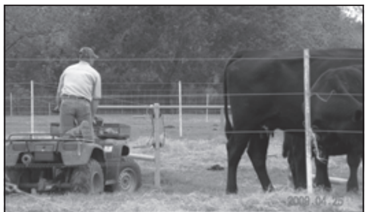
Where is the horse?