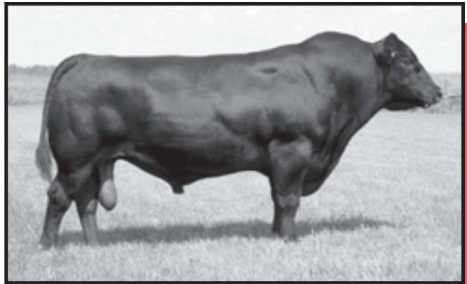
Woodhill Foresight - Reference

Owned by: J Bar Angus Ranch "615" ranks in the top 1% for CED, & CEM, 2% for BW, 5% for CW, 10% for $F, 15% for YW, and 20% for $W EPDs. AI'd to Woodhill Foresight on 2/02/10. Pasture exposed to Live Oak Focus 871 (15939347).