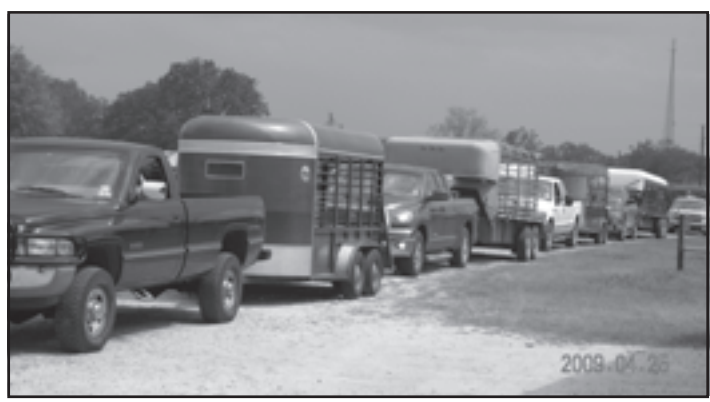
Loading out immediately after the sale.

Owned by: J Bar Angus Ranch Birth Weight 75 lbs.