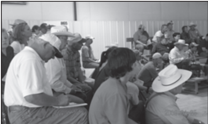
Very attentive crowd!

Owned by: J Bar Angus Ranch "923" ranks in the top 15% for YW, Milk and $F EPDs. Her individual ratios are BR 106, WR 104, and YR 107. AI'd to GAR Retail Product on 12/22/09. Pasture exposed to Live Oak Focus 871 (15939347) from 1/21/10 to 3/15/10.