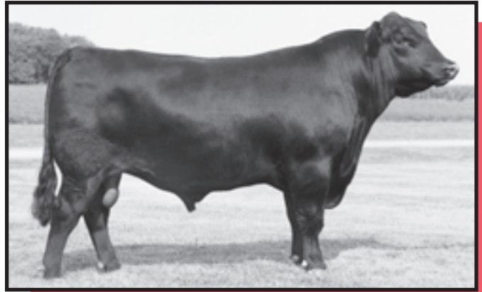
Bon View New Design 878 - Reference

Her proven curve bender sire transmits muscle and powerful phenotype, good udders and excellent maternal performance. Bred natural service to Rising Hill New Frontier 6448 on 12/12/09. Pasture exposed to BC Objective T54.