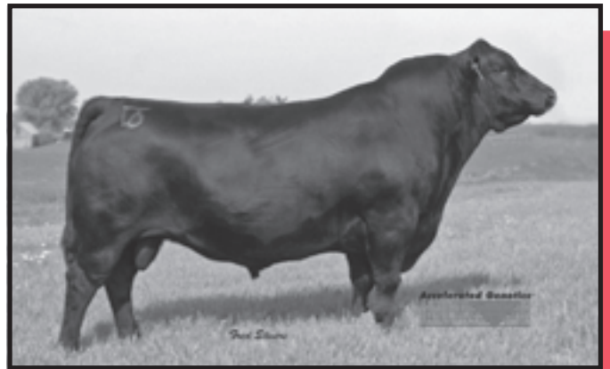
Sinclair Net Present Value - Reference

This cow has an excellent disposition. The "Victoria" cow family has done well in our area. Pasture exposed to BC Objective T 54.