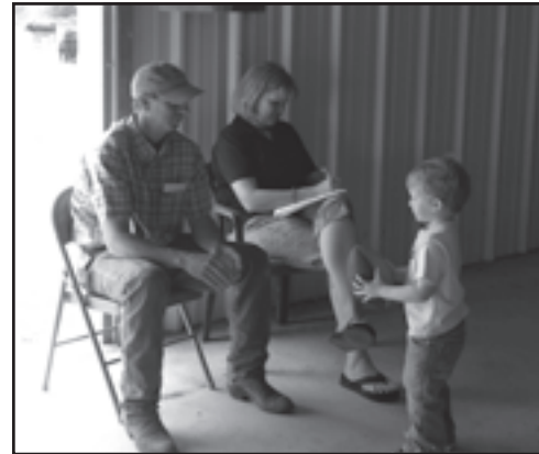
Dad, when can I raise my hand?

Owned by: Sarofim Ranch Sells as a pair with heifer calf born 1/17/10 by Live Oak 1407 193N (BW 58 lbs). Pasture exposed to sire of calf.