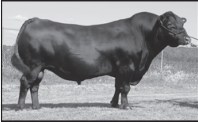
GAR Retail Product - Reference

Owned by: J Bar Angus Ranch "916" ranks in the top 10% for $F, 15% for YW, YH, CEM, Marb., & $QG, and 20% for CED, BW, $B EPDs. Her individual ratios are BR 95, WR 99, and YR 108. AI'd to GAR Retail Product on 1/04/10. Pasture exposed to Live Oak Focus 871 (15939347) from 1/21/10 to 3/15/10.